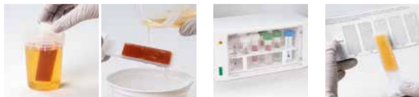
Dip or pour